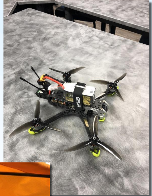
Dave's 5" Quadcopter